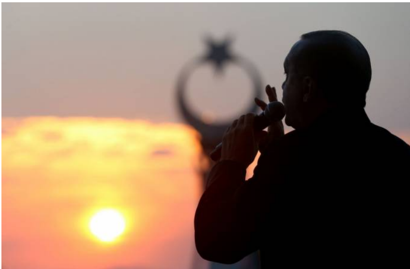
Recep Tayyip Erdogan: the Turkish leader's family interests in Malta are the subject of scandal in Turkey